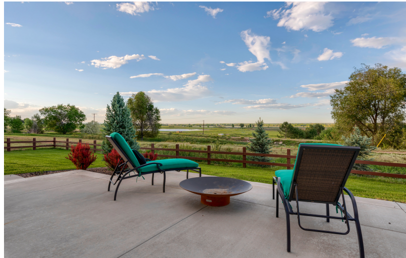
Wonderful Open Floorplan!