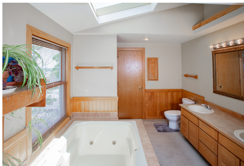
Bright and Open 2 Story Home

Nestled in the foothills outside of Berthoud finds this 3 bedroom 2 bath fully fenced 2 story home on 2.27 acres. Large master suite with private deck and soaking tub. Large deck over looks lots of perennials, trees and Foothills. Neighborhood backs to open space for hiking and horseback riding.