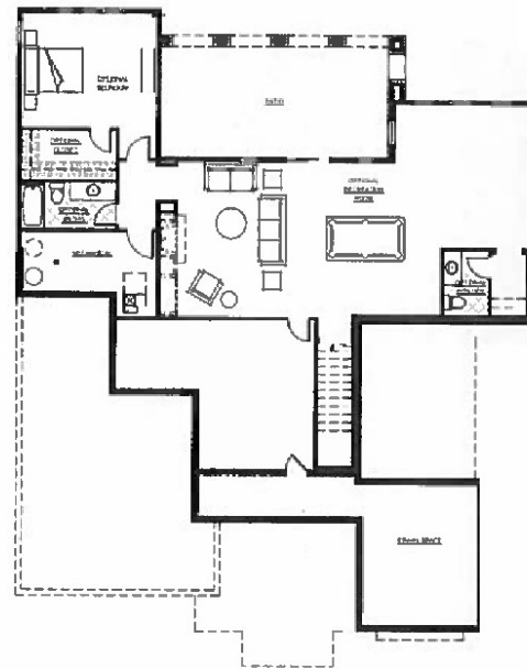
LANDING AT BASEMENT LEVEL 40 sq ft

https://2544chaplincreek.thegroupinc.com/